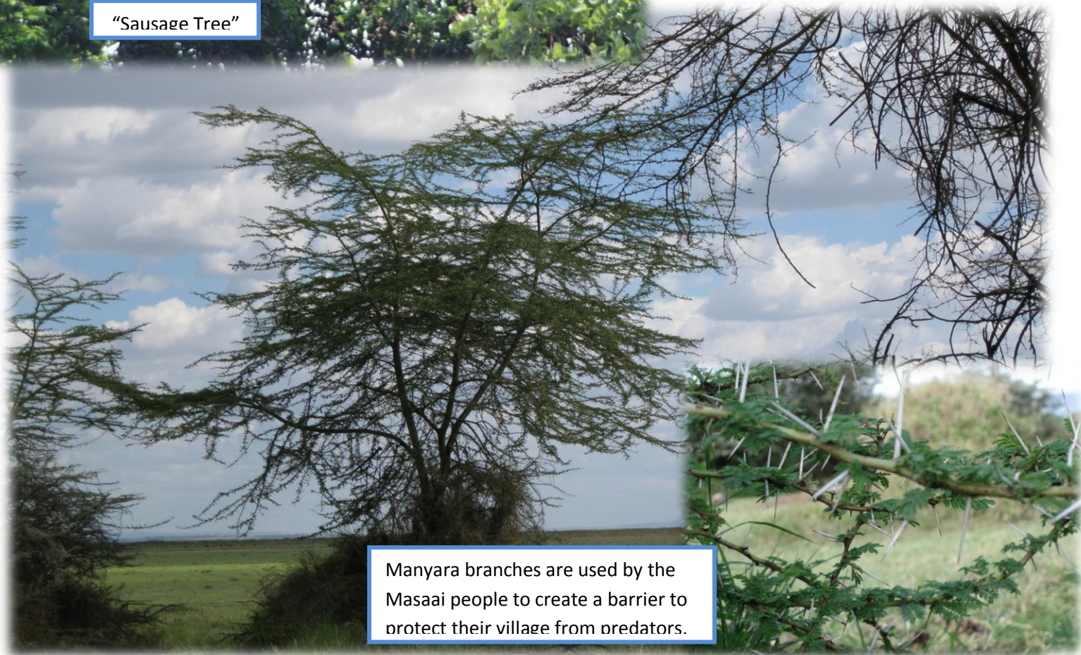
Manyara branches are used by the Masaai people to create a barrier to protect their village from predators.